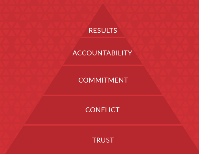
The Five Behaviors of a Cohesive Team® Model